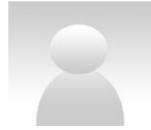
Manager Profile 20115