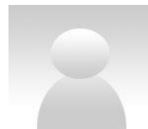
Manager Profile 18353