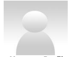
Manager Profile #16730